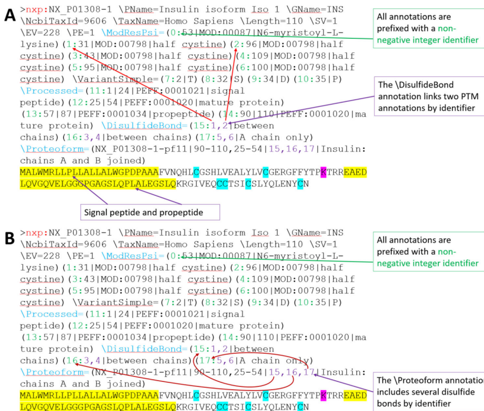
Figure 2. Simplified depiction of how annotation identifiers can be referenced by other annotations to link them, such as for disulfide bonds and for proteoform definitions. Each annotation has a non-negative integer identifier, and other annotations may link to them. This example (somewhat simplified for clarity of presentation) for human insulin encodes: A) PTMs and disulfide bonds that link two PTMs; and B) a final proteoform that include two separate processed chains that are linked together via disulfide bonds.