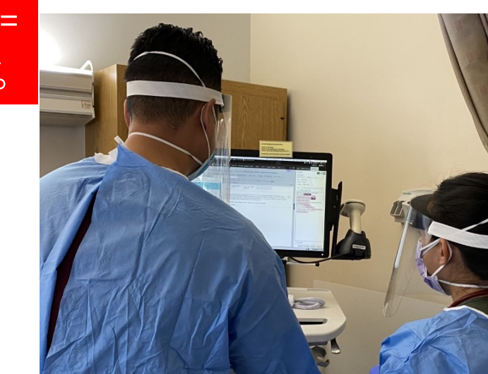
Figure 3: 4 Eyes Skin Check Documentation