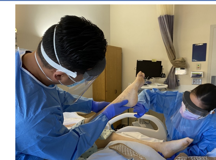
Figure 2: 4 Eyes Skin Assessment